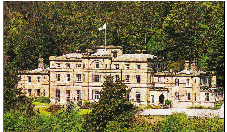
WILLERSLEY CASTLE, CROMFORD, MATLOCK DERBYSHIRE DE4 5JH

Willersley Castle, a 200-years old grade 2* listed building, designed in the style of a medieval castle. It occupies a magnificent position on the edge of the Peak District overlooking the River Derwent. It lies within the Derwent Valley Mills World Heritage Site just south of Matlock Bath. It has 60 acres of grounds, ranging from meadows to limestone crags. Facilities include a heated swimming pool, table tennis, snooker, putting etc.